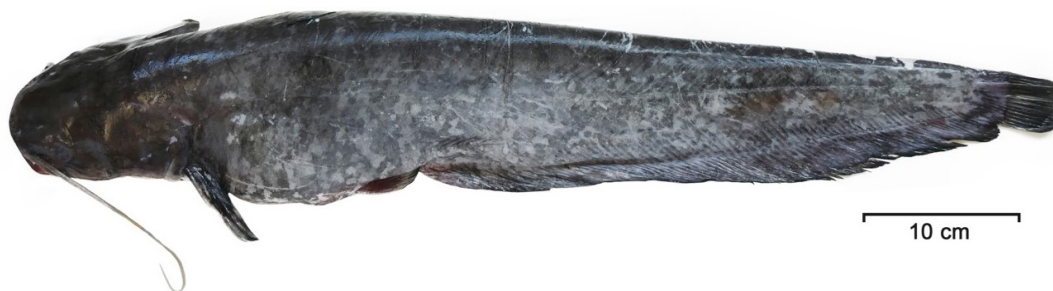
Figure 2. Specimen of Silurus glanis (690 mm total length and 1920 g) captured in the Douro River (Carrapatelo Reservoir, Portugal) and deposited in the zoological collections “Museu Bocage” of the Museu Nacional de História Natural e da Ciência (MUHNAC; Lisbon, Portugal). Exemplar de Silurus glanis (690 mm de comprimento total e 1920 g) capturado no rio Douro (Albufeira da Barragem do Carrapatelo, Portugal) que foi depositado nas coleções zoológicas do “Museu Bocage” do Museu Nacional de História Natural e da Ciência (MUHNAC; Lisboa, Portugal).

In recent decades, S. glanis has been increasingly introduced for recreational angling owing to demand for large-bodied specimens by trophy anglers, as their addition to freshwater fisheries is likely to boost annual revenue (Rees et al., 2017). Since its first record to the Iberian Peninsula in 1974 at Mequinenza-Ribarroja reservoir (Ebro drainage, Doadrio, 2002), the European catfish has been recorded across Catalonia (Benejam et al., 2007), Tagus (Pérez-Bote & Roso, 2009) and Guadalquivir drainages (Moreno-Valcárcel et al., 2013; Fernández-Delgado et al., 2014; Sáez-Gómez and Prenda 2019). Catfish has recently reached Portugal, probably through downstream dispersal along the Tagus River from Spain (Gkenas et al., 2015), which suggests that this species follows a westward expansion in the Iberi-