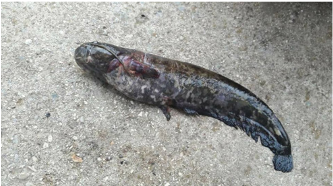
Fig 2. The specimen of Silurus glanis caught in the area of Neretva River delta on 15 April 2018. This photo was posted by the fisherman in the Facebook group „Morski ribolov“